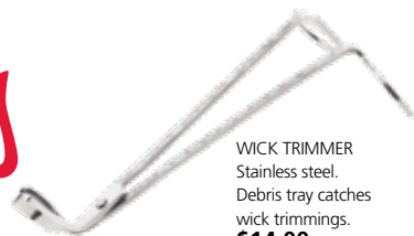
WICK TRIMMER Stainless steel. Debris tray catches wick trimmings. $14.00