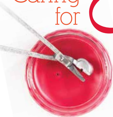
CLASSIC WICK DIPPER Chrome and metal. Extinguish without residual smoke. $3.00